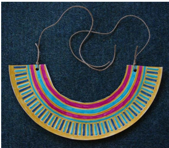
← Figure 3: Finished collar

Here is Sennefer, the Mayor of Thebes. → He wears armlets on his upper arms and bracelets at his wrists. Over a broad jewelled collar he wears a double strand necklace of gold beads, a mark of honour awarded to him for good service to his king. He also wears golden earrings and a pair of heart amulets as a pendant on a cord or chain. He holds a posy of lotus flowers (water lilies) in one hand and his official staff in the other.