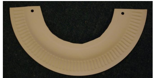
Figure 2: → Underside of rim, pierced for threading and ready for decoration